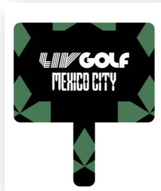
LIV Golf Paddle Sign