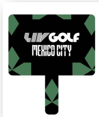
LIV Golf Paddle Sign